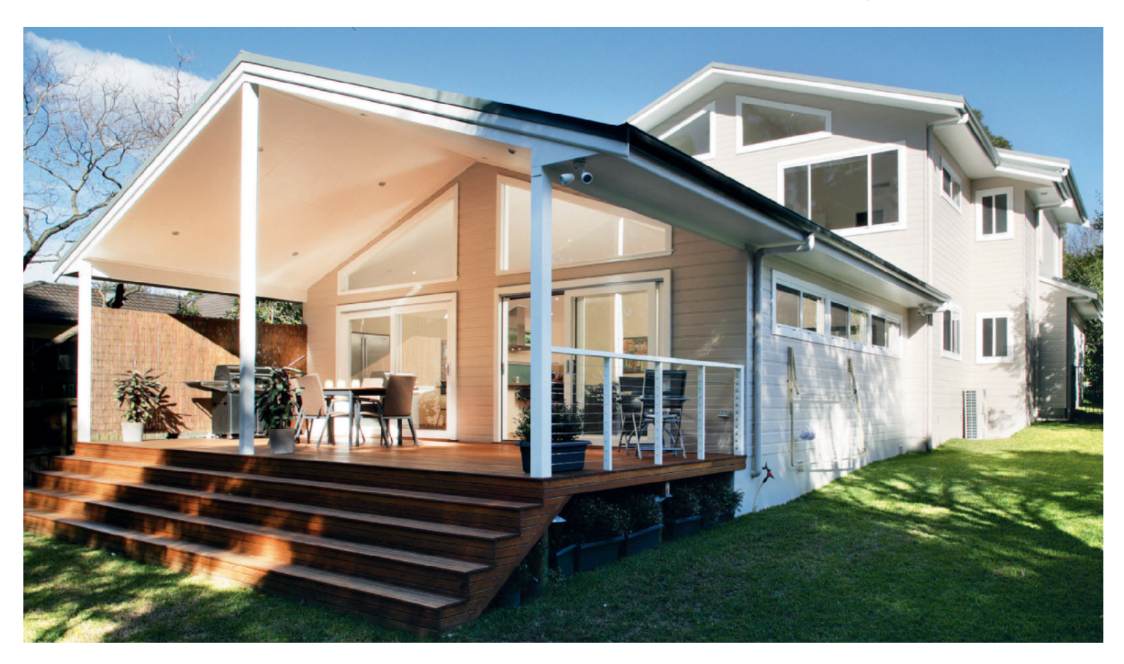
Classic Country Cottages incorporates timeless architecture with today's high-tech developments.

houses and romantic timber country homes; these standard designs can also be modified to suit the site, orientation, council controls etc, strengthening the company's ethos of building individual homes. Classic also creates custom designs in collaboration with clients. Its complete design service allows clients to work with the designer to create a home that meets their personal requirements and makes the most of their site's unique features. Even homes from the standard design range can be customised to suit the clients' site, budget, family size and other considerations.