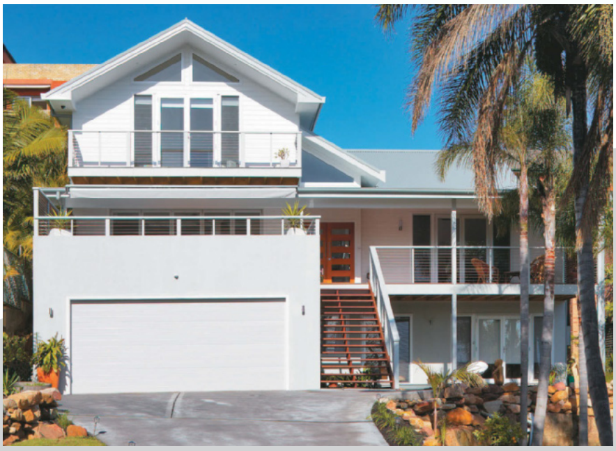
The Wyadra Beechwood