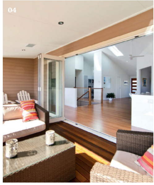
Classic Country Cottages aims to "never build the same home twice".