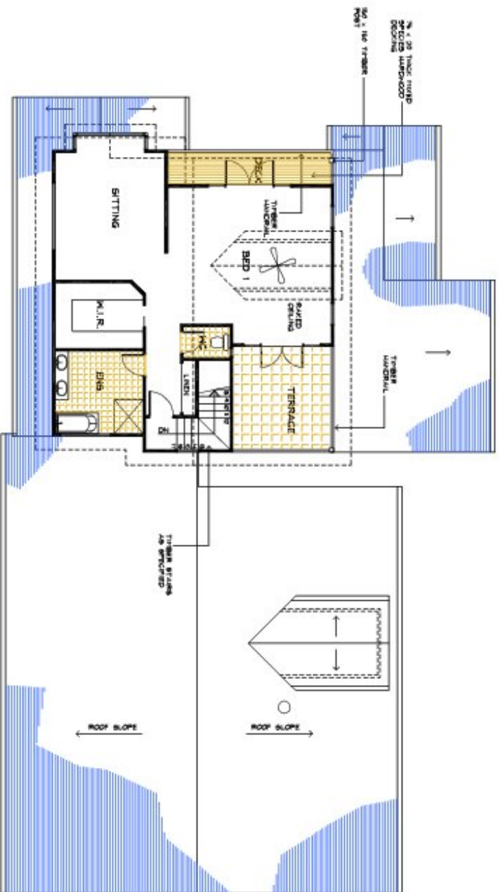
FIRST FLOOR PLAN © CLASSIC BUILDING & DESIGN

*PLEASE NOTE ROOM DIMENSIONS ARE NOT DISPLAYED AS WE CUSTOMISE THE HOME TO SUIT YOUR REQUIREMENTS